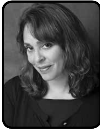
Natasha Trethewey Special Guest