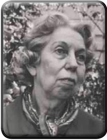
Eudora Welty (1909-2001)

Friday, February 19, 2016 Millsaps College Jackson, Mississippi Celebrating the Pulitzer Prize Centennial and Three Mississippi Winners: Eudora Welty, Natasha Trethewey, and Tennessee Williams