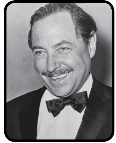
Tennessee Williams (1911-1983)